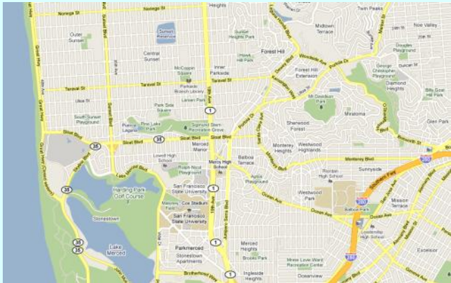
Summer Solstice potluck picnic Saturday June 19 at 11:00 a.m. Pine Lake in Stern Grove.